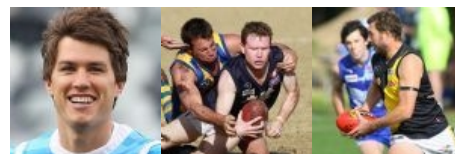
Geelong Cats training, July 24,