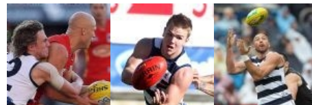
Geelong Cats v Suns, July 8, 2012